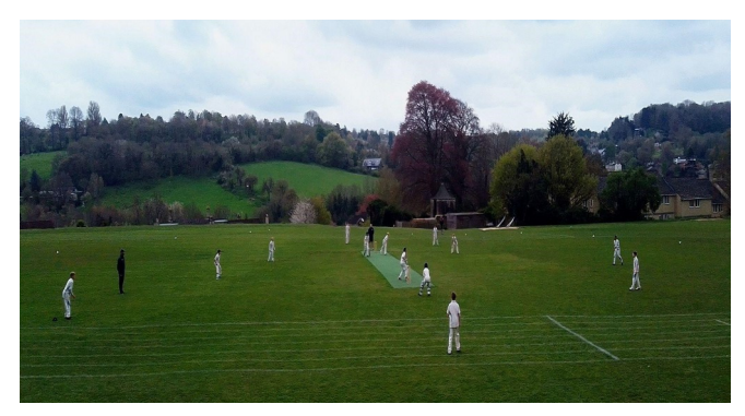
U12 Cricket vs Prior Park

Monday 5th June Term 5—Summer Term begins