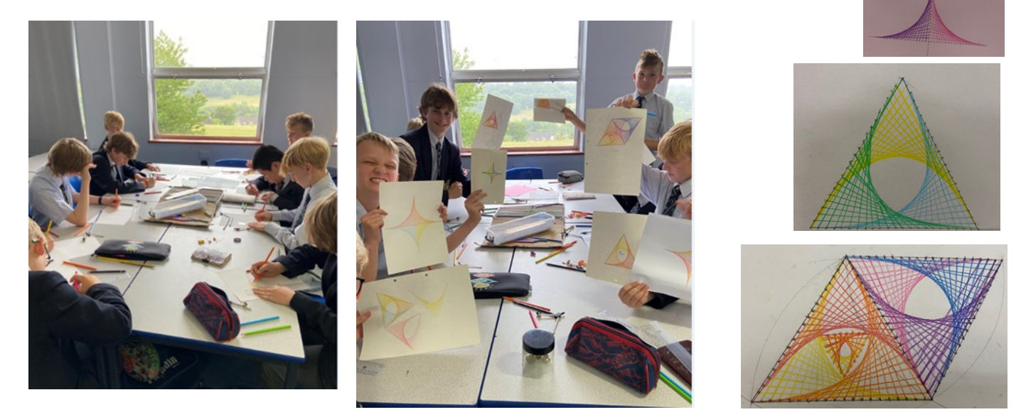
Mrs A Smart Maths

The objectives were to draw curves using a ruler, and we achieved exceptional artistics results. Well done boys, very creative!