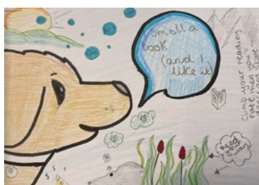
Dylan O (Y7 winner)