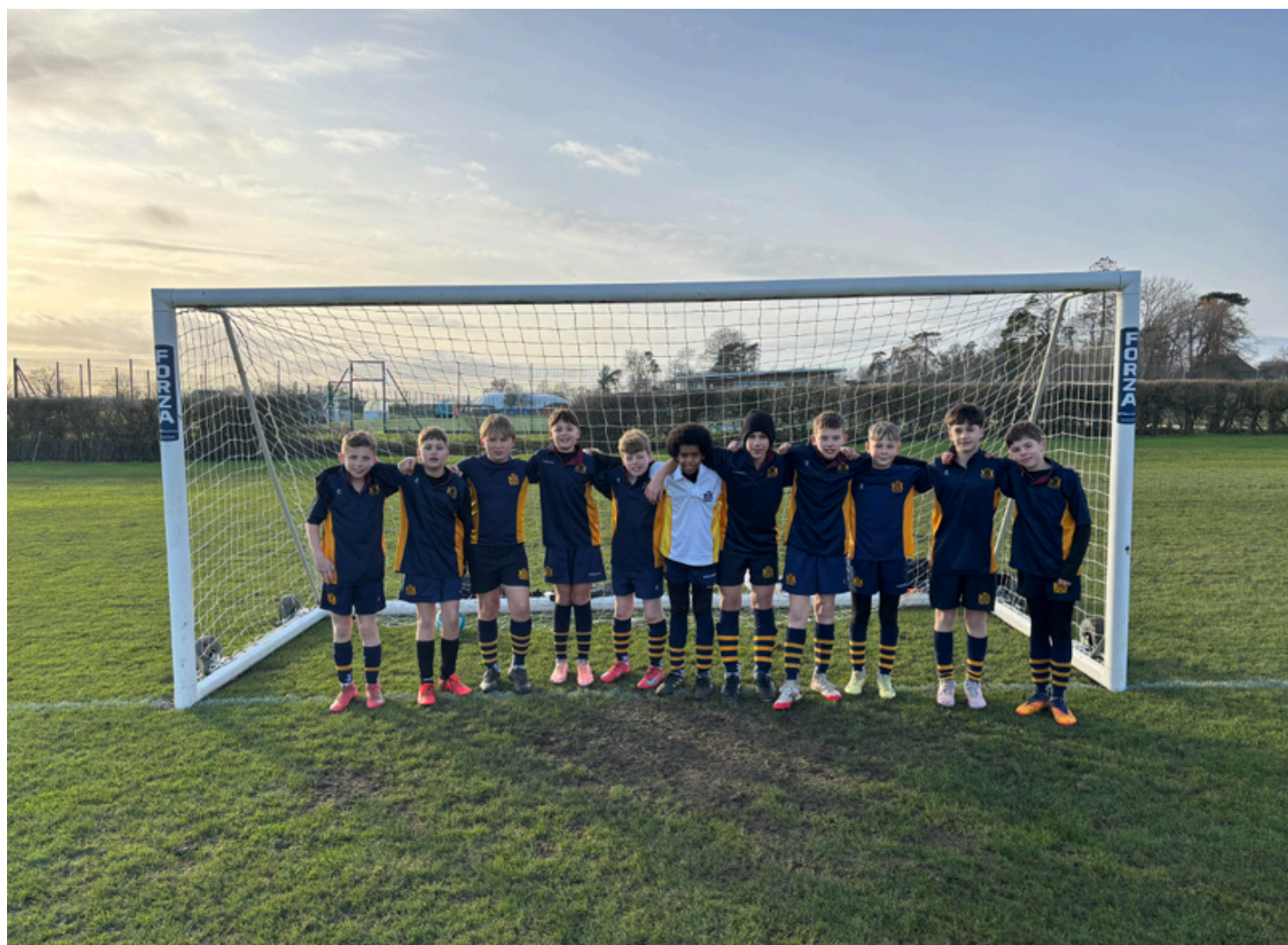
U12 A team.