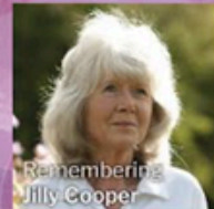
Remembering Jilly Cooper