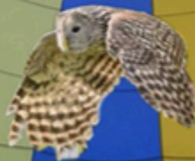
BIRDS OF PREY