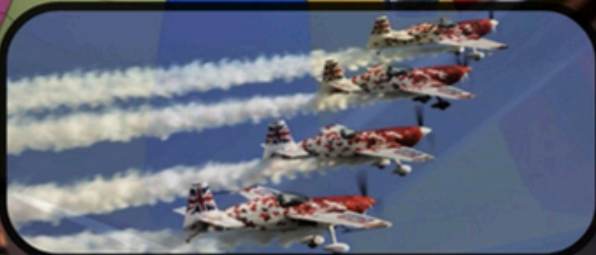
AEROBATICS DISPLAY TEAM