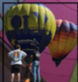
HOT AIR BALLOONS